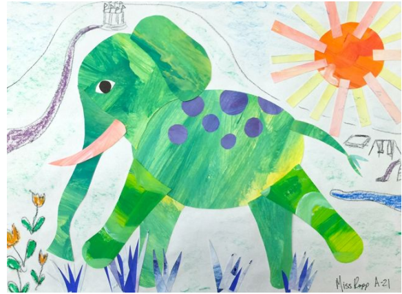
First Grade Artwork Eric Carle-Inspired Animals